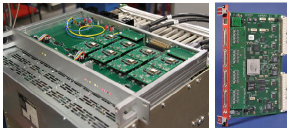
Figure 1: Prototype board with 8 QFW-ASICs (left), standard FPGA-I/O VME board (VUPROM) (right)

GSI Beam Diagnostics department together with Experimental Electronics department has started investigations on a new economical solution for SEM-Grid (Secondary Electron eMission Grid) electronics. The front-end amplifiers and control devices of the existing version are outdated and very expensive. After extensive and promising tests with a 4-channel QFW (Charge-Frequency-Converter) test board [1, 2], it was decided to develop a prototype system with 8 QFW-ASICs (see Fig. 1). The goal of the project was to perform a functional test of ASICs connected to a SEM-Grid under real beam conditions at GSI.