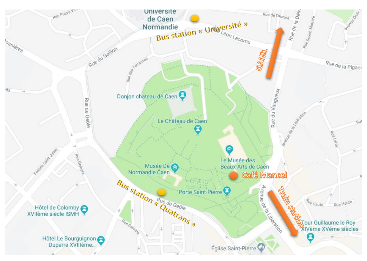
Bus station line A: "Quatrans" or "Université"